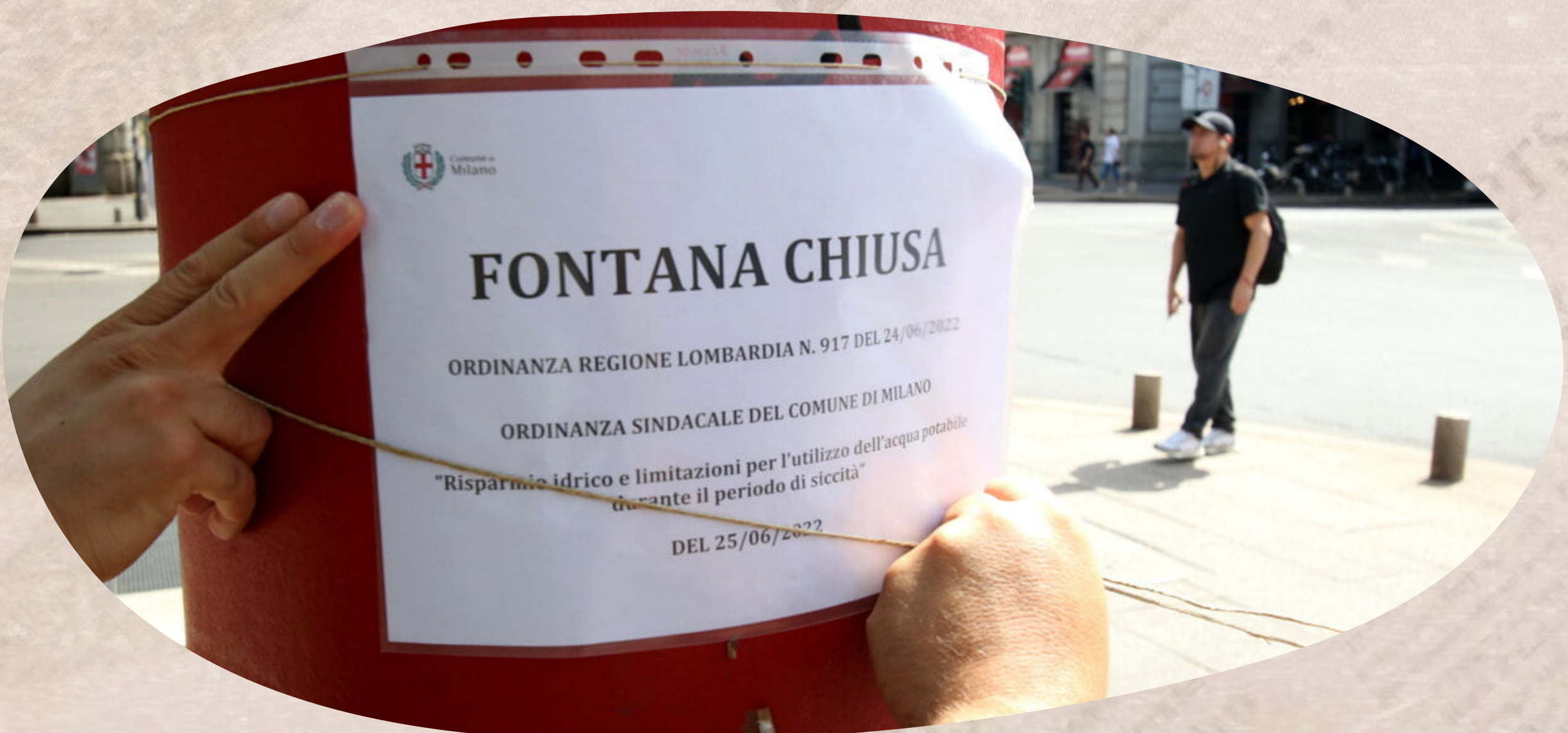
A sign in a town in Lombardy saying " Fountain closed " due to drought problems