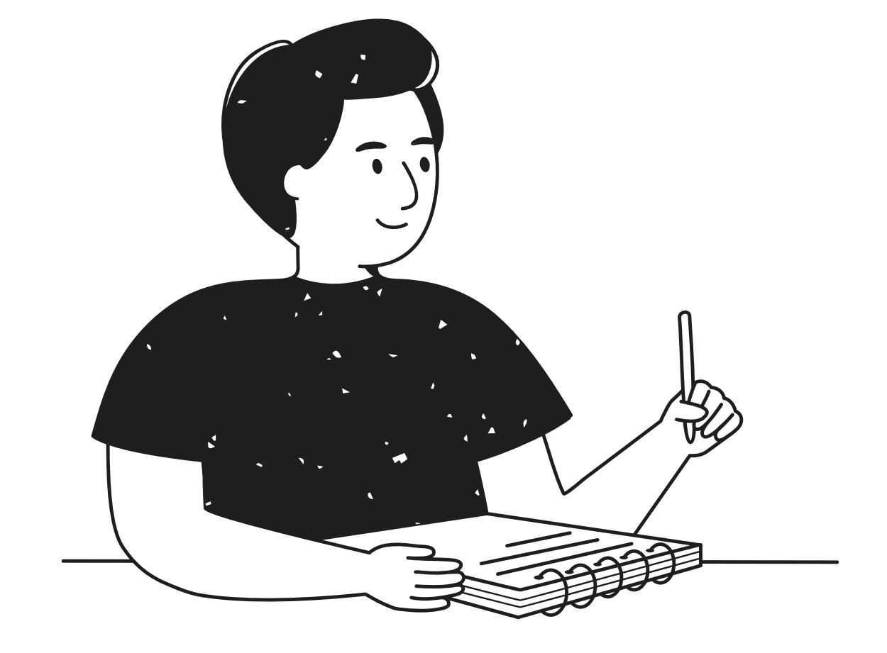
May Day associates perhaps everyone in the Czech Republic with first verses of the famous poem

In the Czech Republic May 1st is a national holiday known as Labour day (in Czech: Svátek práce). However, most Czechs regard the 1st of May as the "day of love". A popular tradition maintained on May 1st in the Czech Republic is to kiss your loved one beneath a blossoming cherry tree. Tradition says that a girl who is kissed under a blossoming cherry tree will remain beautiful all year long.